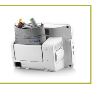
Unique accessory cabinet