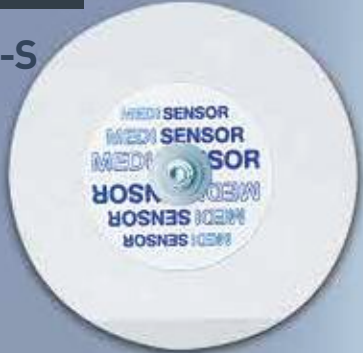
MODEL T 601-S

30 pcs / pouch – 1500 pcs / carton Packaging 30 pcs / pouch – 1500 pcs / carton Available also with Ø 50 mm Model W 601 and also with liquid gel Model W 601-L