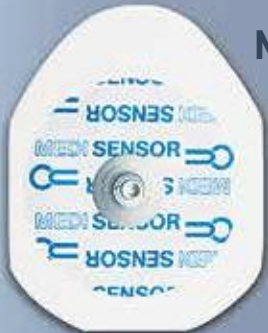
MODEL FS 501-S