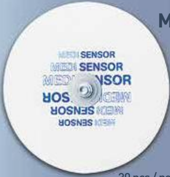
MODEL F 50-S