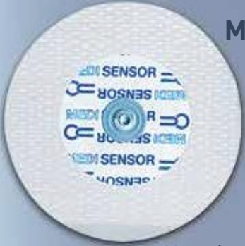
MODEL W 601-S