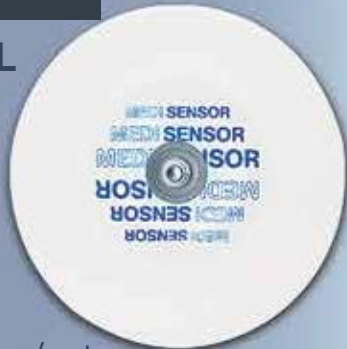
MODEL F 55-L

30 pcs / pouch – 1200 pcs / carton Packaging 30 pcs / pouch – 1200 pcs / carton