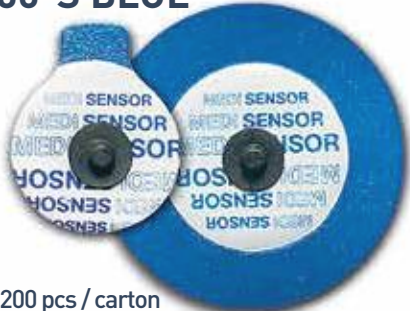
MODEL F 50-S BLUE

50 pcs / pouch – 2000 pcs / carton Packaging 30 pcs / pouch – 1200 pcs / carton