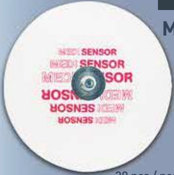
MODEL FS 50-L