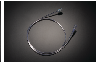
TAG C150 HPCT**