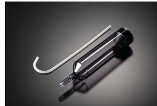
ART 700 SYR

MEDRAD® VFlow software and Sterile Hand Controller (VF HC) enable consistent and precise contrast delivery at fixed and variable flow rates.***