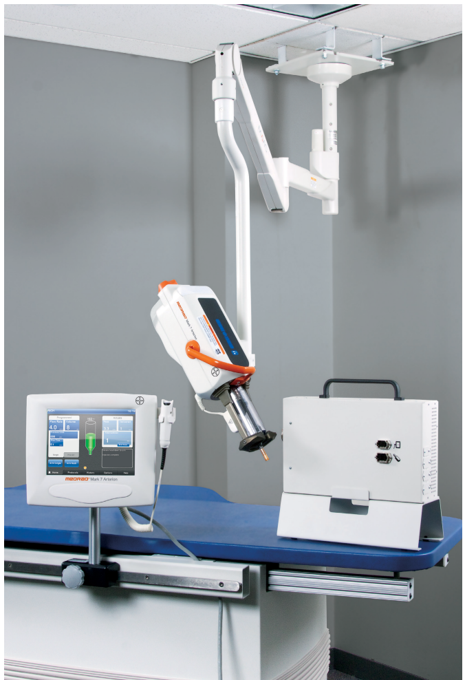
MEDRAD® Mark 7 Arterion Overhead Counterpoise*