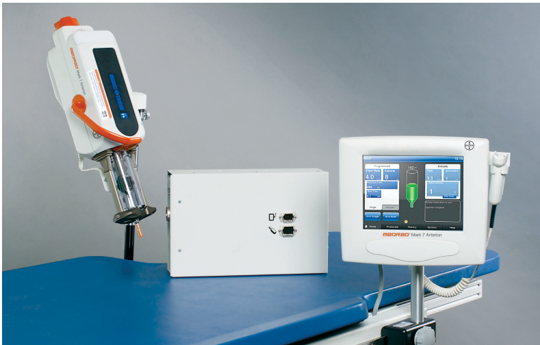
MEDRAD® Mark 7 Arterion Table Mount*