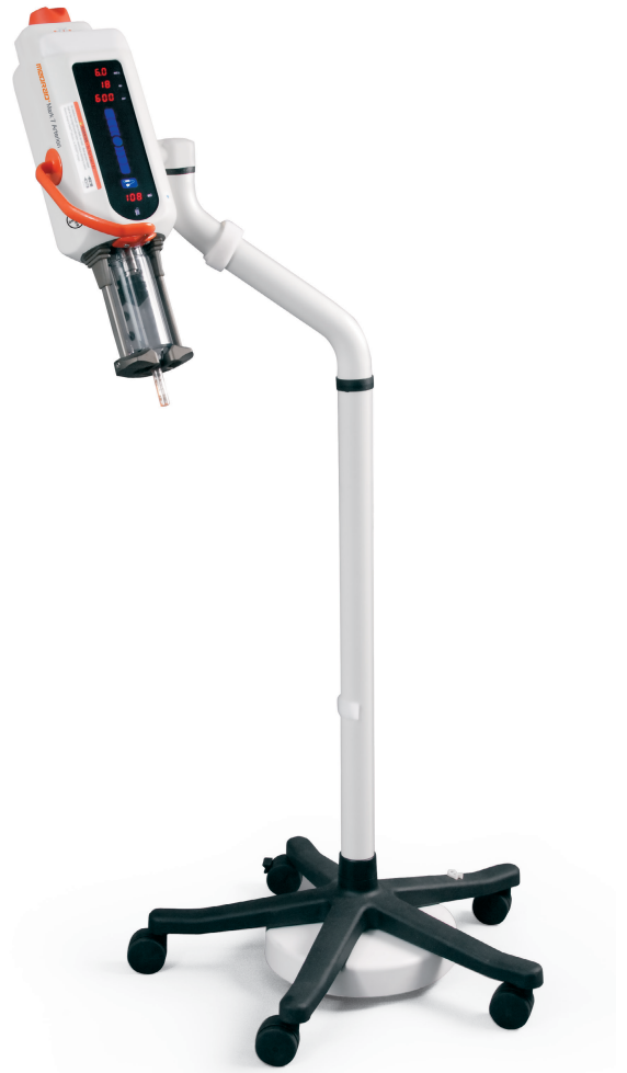
Freestanding Pedestal on Wheels or Adjustable Height Pedestal on Wheels

Additional accessory option to relocate the injector head from the table.