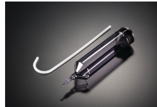
TAG 150 SYR**