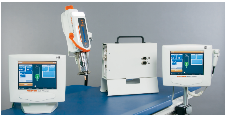
MEDRAD® Mark 7 Arterion Table Mount with Dual Display Option*