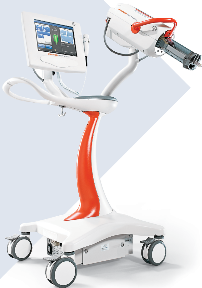
MEDRAD® Mark 7 Arterion Pedestal

Each suite is unique. With MEDRAD® Mark 7 Arterion, you can choose the configurations and mounting options for your suite and imaging system to optimize your workflow.