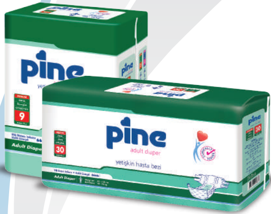
Adult Diaper/Yetişkin Bezi