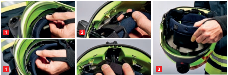
1: Fixing points front 2: Fixing points rear

The wearing height is easiest to adjust when the interior fittings are removed.