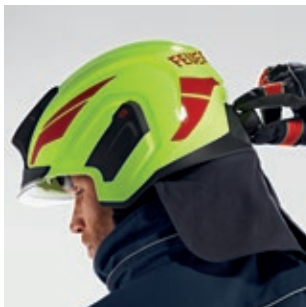
Size regulator to be turned on to „minimum“