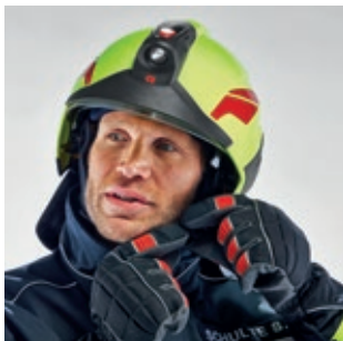
Putting on the helmet

The setting screw on the outside of the helmet can be used to adjust the size from 49 to 67; if the head size is smaller, the basic width of the headband can also be adjusted. Open the helmet harness, put the helmet on and tighten the harness until the helmet sits firmly, without a feeling of excessive pressure.