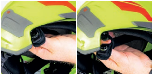
Figure 2 and 3: Dissassembly / Assembly

The assembly takes place in reverse order. Following the opening of the neck strap (adjacent to the adjustment mechanism), the chinstrap can be slipped out and then washed in a washing machine at 60 °C.