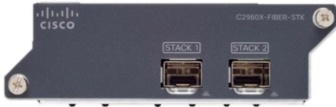
Figure 7. Cisco FlexStack-Extended: Fiber module