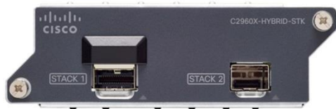
Figure 6. Cisco FlexStack-Extended: Hybrid module