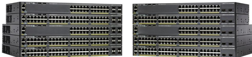
Figure 1. Cisco Catalyst 2960-X Series Switches

Cisco® Catalyst® 2960-X and 2960-XR Series Switches are fixed-configuration, stackable Gigabit Ethernet switches that provide enterprise-class access for campus and branch applications (Figure 1). They operate on Cisco IOS® Software and support simple device management as well as network management. The Cisco Catalyst 2960-X and 2960-XR Series provide easy device onboarding, configuration, monitoring, and troubleshooting. These fully managed switches can provide advanced Layer 2 and Layer 3 features as well as optional Power over Ethernet Plus (PoE+) power. Designed for operational simplicity to lower total cost of ownership, they enable scalable, secure, and energy-efficient business operations with intelligent services. The switches deliver enhanced application visibility, network reliability, and network resiliency.