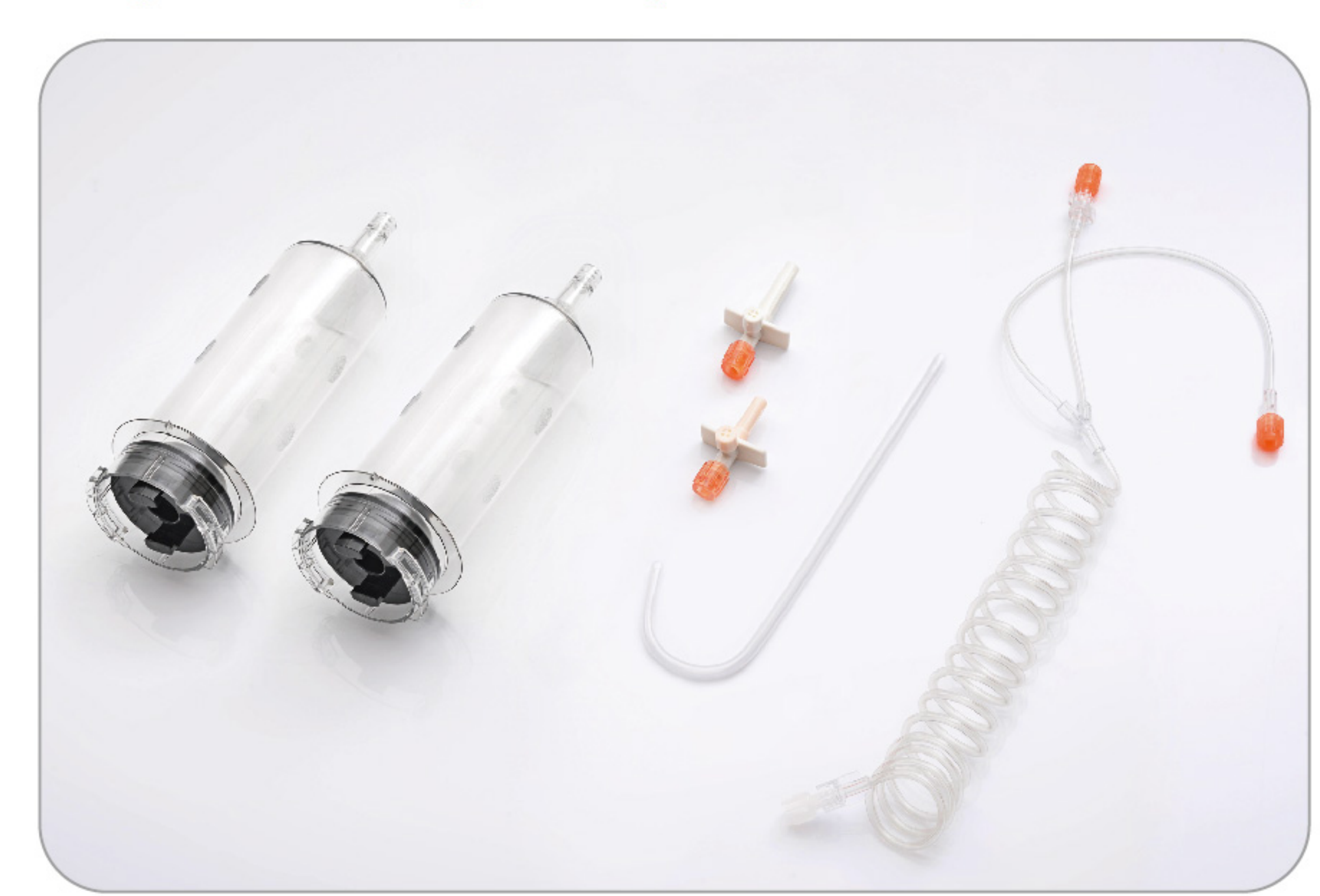
200ml Syringe for Contrast 200ml Syringe for Saline