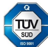
Greg Bates Director Business Assurance America Page 1 of 2

The certificate is valid from March 6, 2024 until March 5, 2027 With a re-issue date on N/A