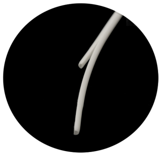
HIGHSTREAM & HIGHSTREAM II have a special SPLIT TIP design