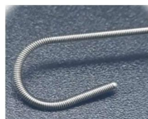
"J" Tip Nitinol Guidewire

16 Fr Valved Peelaway Sheath**, **only for OPTIMA II AND HIGHSTREAM II set content