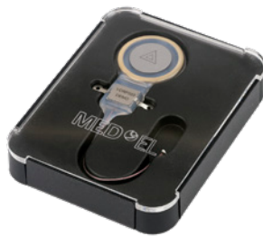
VORP 503 Demo + Display Box

Further demo products for the VIBRANT SOUNDBRIDGE can be found in our Demo Kit Product Catalogue which contains lots of demos for all MED-EL hearing solutions.