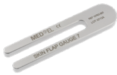
Skin Flap Gauge 7