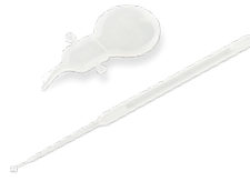
VORP 503 Sizer Kit

The Skin Flap Gauge 7 can be used to measure the skin flap thickness over the implant. It can be sterilised and reused.