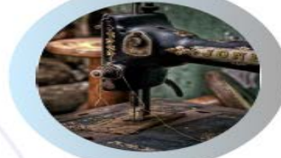
Years of Experience