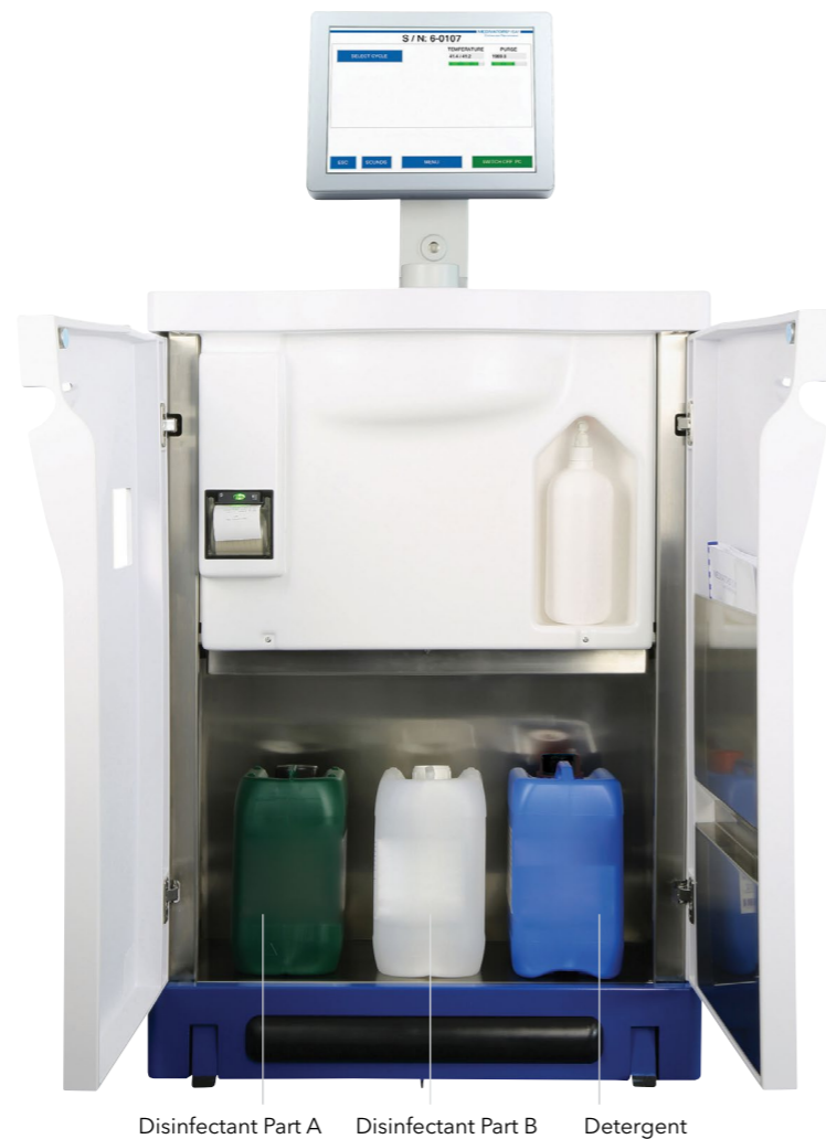
Disinfectant Part A Disinfectant Part B Detergent

The MEDIVATORS ISA Endoscope Reprocessor is a rapid, efficient and flexible reprocessing system designed for endoscopy units demanding the most advanced technology and the highest quality standards.