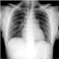
Image processed with everest-X