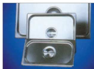
Flat Lid (included)