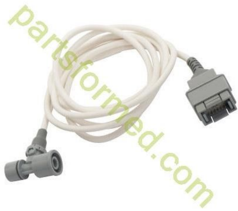
Vyaire Medical (CareFusion / Viasys) 16465, 51000-40081 flow sensor for AVEA