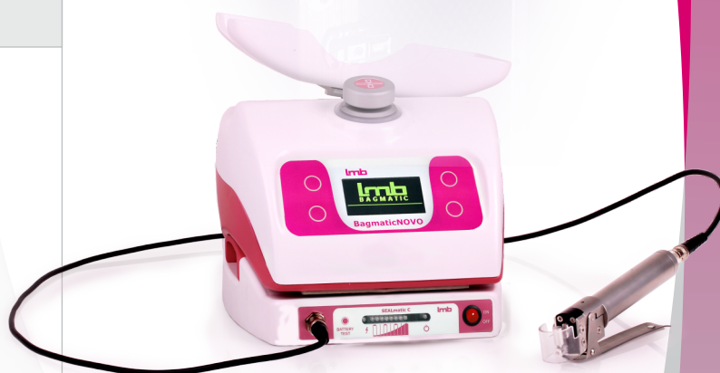
Bagmatic NOVO with SEALmatic C