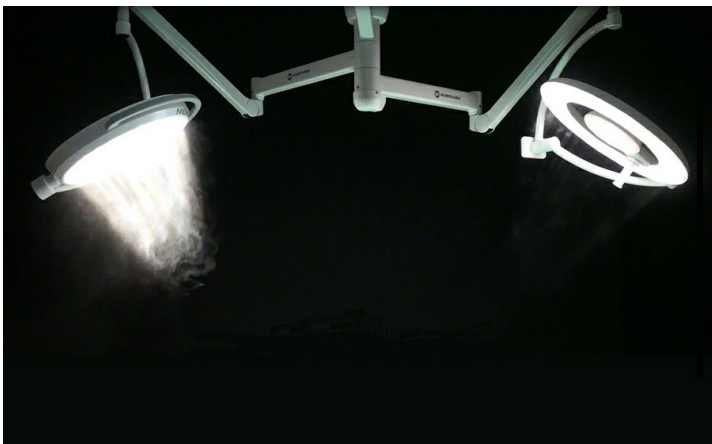
OPTIMISED FOR THE OPERATING ROOM