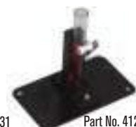
Part No. 4120032