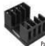
Part No. 4120031