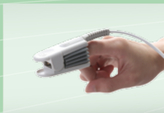
Unique Sensor Design