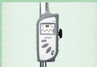
Bed Rail Mount