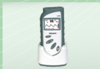
Battery Charger Stand