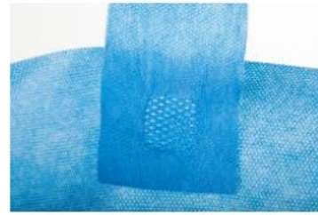
Ultrasonic Welded Belts for Maximum Security