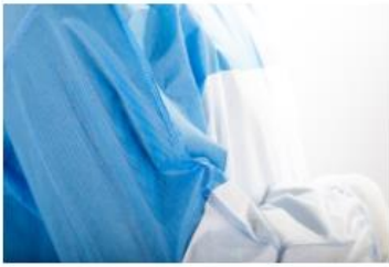
Ultrasonic Welding for Enhanced Security