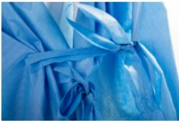
4 Laced Belt Tie for Better Security