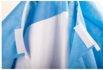
Velcro Tape for Better Grib Around the Neck