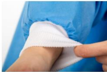
8 cm Long Elastic Cuff