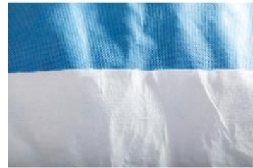
Extra Protective Layer