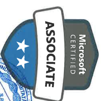
Satya Nadella Chief Executive Officer

A handwritten signature in black ink, appearing to read "S. Nadella".