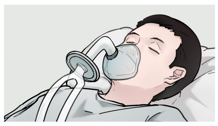
Non-invasive therapy —— NIV and O<sub>2</sub> therapy

With extensive ventilation modes and smart sync techs, V3 offers a whole range of treatment: O2 therapy-monitoring-weaning