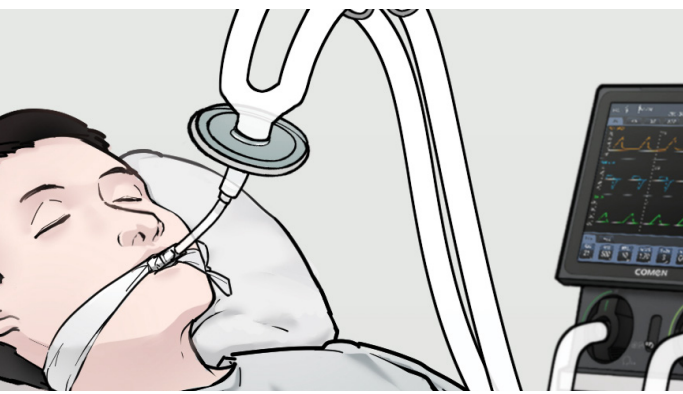
Invasive therapy —— bedside intubation