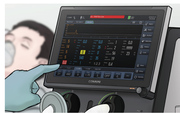
Monitoring — assessment of respiratory status

• Extensive monitoring • Intuitive waveform & parameters