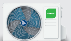
Outdoor unit KLWB