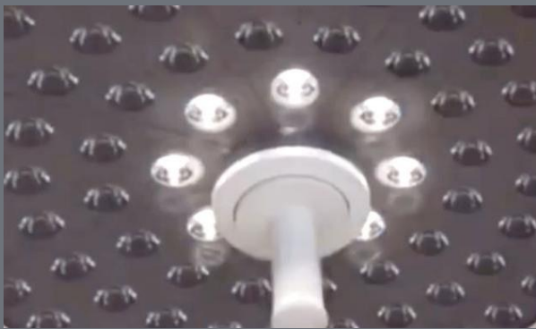
Endoscopy Mode In Deep Illumination For Various Operation Environments