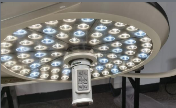
Removable Sterilizer Handle Can Be Easily Replaced by Internal Camera