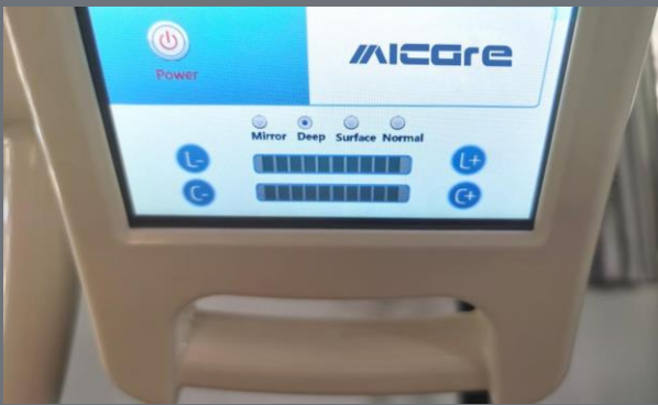
5.1 INCHES LCD Touch Panel Optional (OEM With LOGO Print Available)