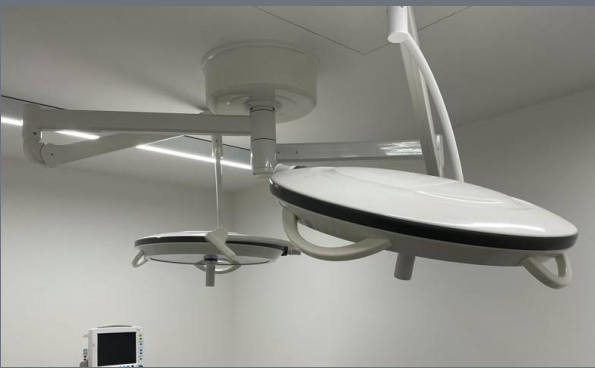
Astro Space Design, Working seamlessly with laminar airflow solutions