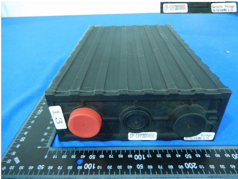
Battery (SP-LFP200AHA 3,2V 200Ah 640Wh)