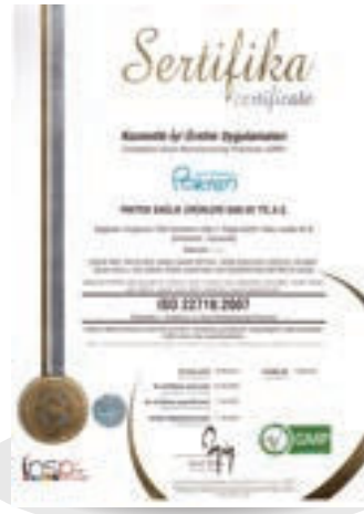
GMP Good Manufacturing Practices ISO 22716:2007