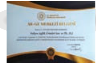
R&D Center Certification