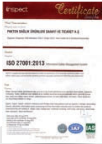
Information Security Management System ISO 27001