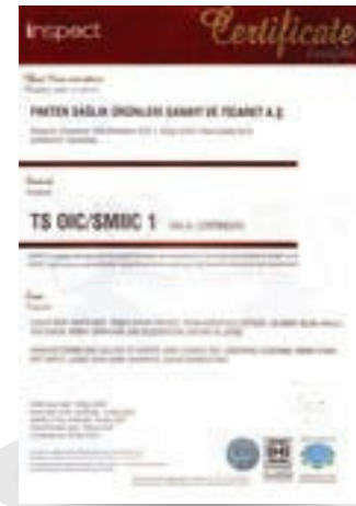
Halal Certificate TS OIC/SMIIC 1