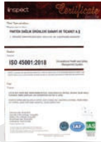
Occupational Health & Safety Management System ISO 45001 - 2018