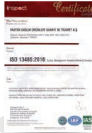
Quality Management System for Medical Devices ISO 13485 - 2016