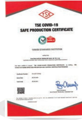
TSE COVID-19 Safe Production Certificate