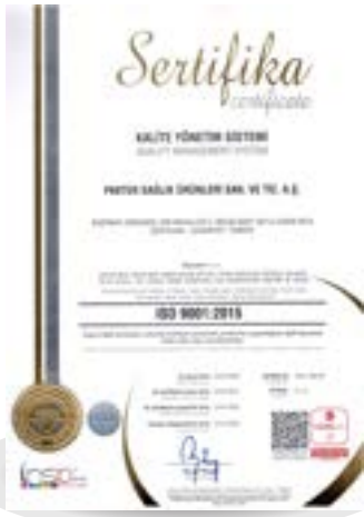
Quality Management System TS EN ISO 9001:2015 IQNET