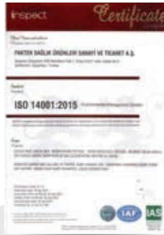
Environmental Management System ISO 14001 - 2015