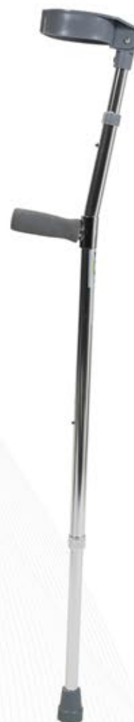
LOCO PR603 Aluminum Adjustable Forearm Crutches