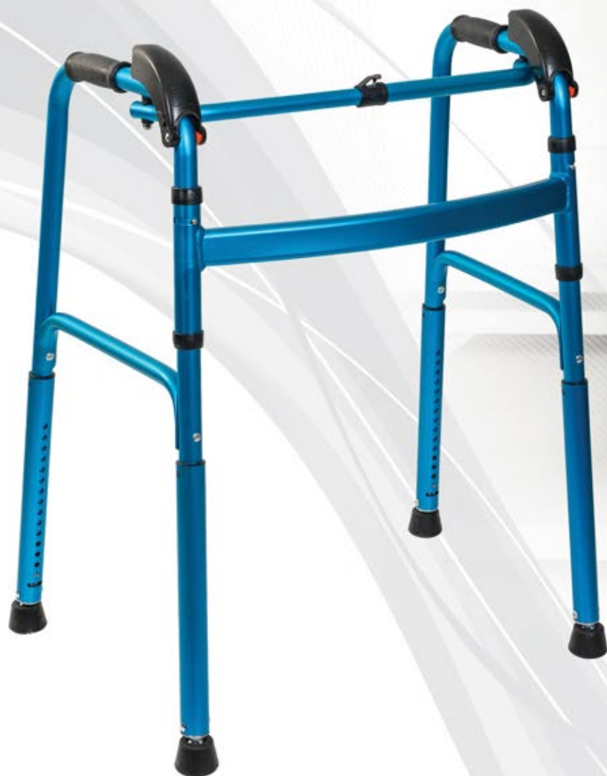
LOCO PR491 Aluminum Stair Walker