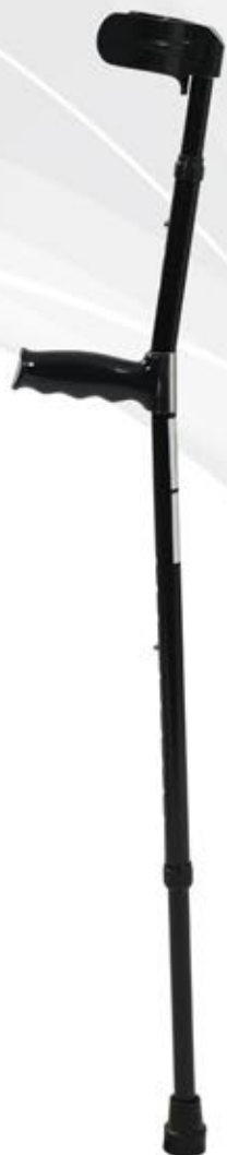
LOCO PR602 Aluminum Adjustable Forearm Crutches