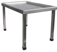
Small Instruments Table