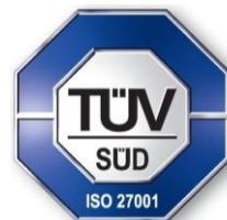
Michael Fernald Head of Central Certification Body Page 1 of 2

The certificate is valid from December 9, 2023 until December 8, 2026 With a re-issue date on September 3, 2025 and Version of the Statement of Applicability: V.11 3/8/2025