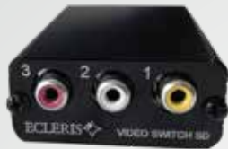
Video switch SD with three video inputs (optional).