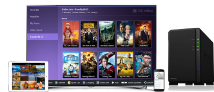
4K Ultra HD multimedia library

Synology DS218play is designed with energy efficiency in mind. Compared with its average PC counterpart, Synology DS218play consumes relatively little power at 16.79 watts when accessed and 5.16 watts when hard drive hibernation is enabled. The scheduled power on/off feature further reduces power consumption and long term operation costs.