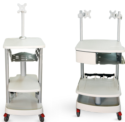
1-cylinder holder (left) and 3-cylinder holder (right) carts