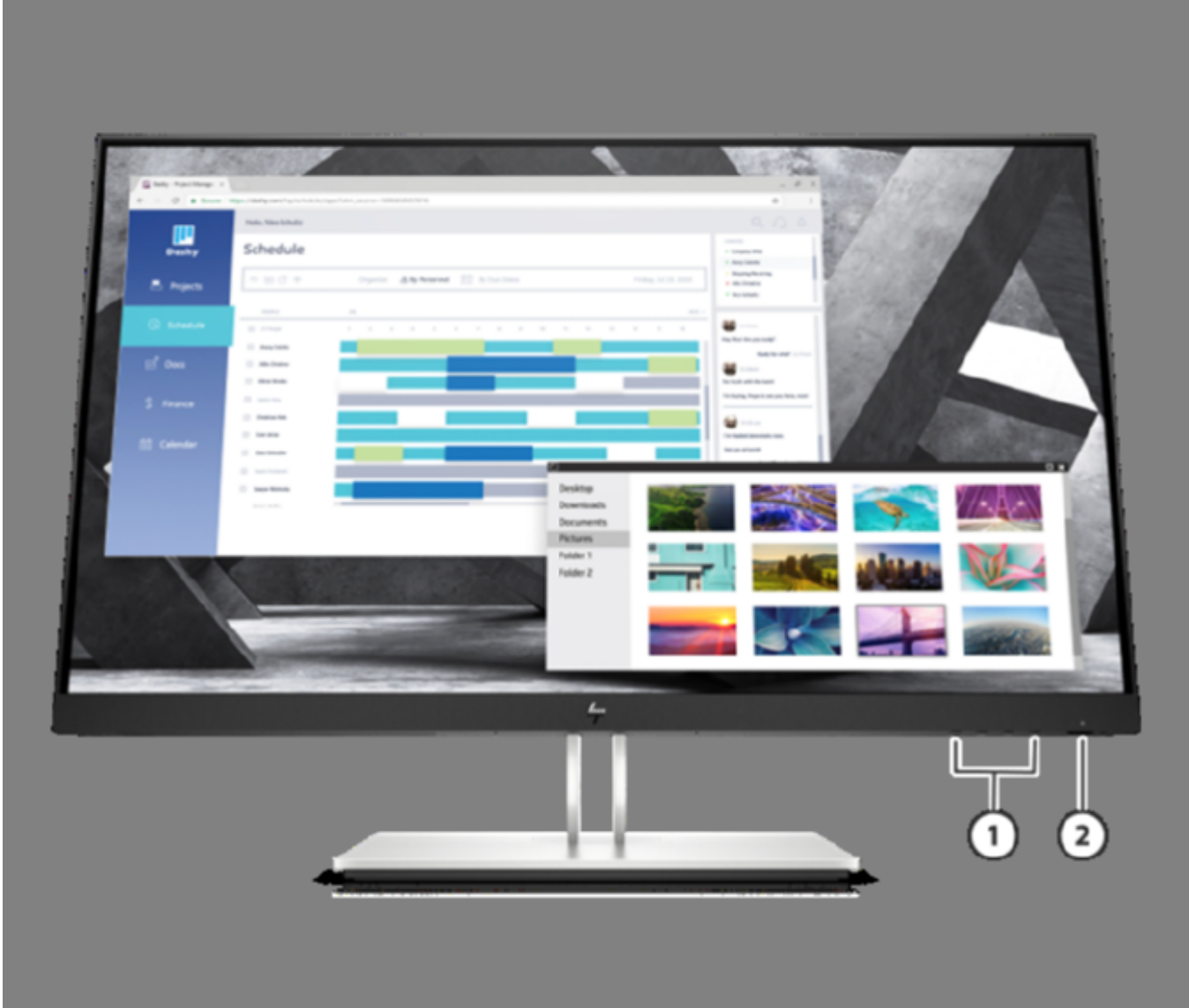
1. OSD Buttons