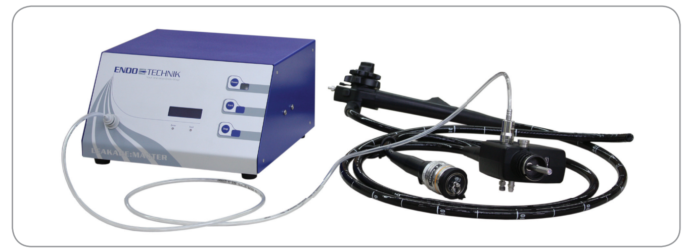
LEAKAGE:MASTER with connected endoscope