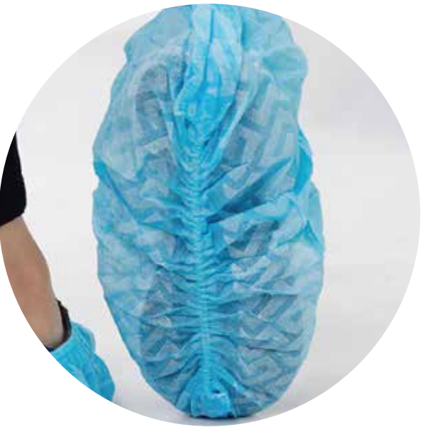
Anti-slip pattern and elastic