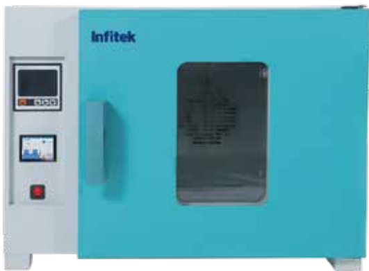
DOF-HAS20A DOF-HAS50A DOF-HAS100A DOF-HAS200A