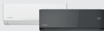
Indoor unit KLW/KLB