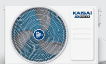
Outdoor unit KLWB