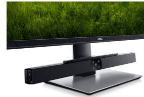
DELL PROFESSIONAL SOUND BAR - AE515M

Optimize your workspace with this efficient 21.5" monitor built with an ultrathin bezel, a small footprint and comfort-enhancing features.