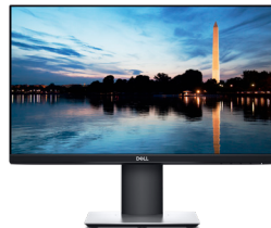
DELL 22 MONITOR - P2219H

23.8" ultrathin bezel optimized for dual display productivity. Easy Arrange feature enables multitasking efficiency and its small base frees valuable workspace.