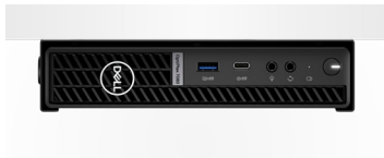
OPTIPLEX MICRO VESA MOUNT WITH ADAPTER BRACKET

Mount your system on a wall or under a surface with a VESA-compatible DVD+/-RW enclosure with full optical drive access. Includes an adapter box to securely house the system's power adapter.