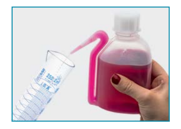
Dispensing tip provides extra fine stream. The tip of the delivery tube can be cut in order to increase the liquid flow rate.