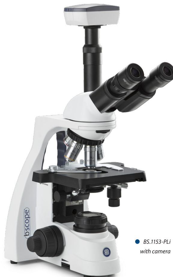
● BS.1153-PLi with camera