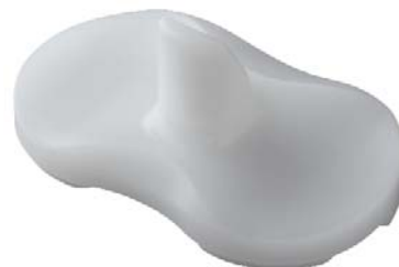
PS High Flex Insert