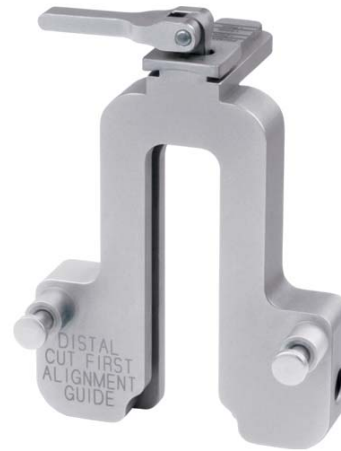
DCF Valgus Alignment Guide

Surgeon choice of large or small block instrument sets. Femoral Instrumentation available in Anterior Cut First or Distal Cut First. Tibial instrumentation available in extra or intra-medullary. Patellar preparation can be accomplished with a resection guide, reamer, large reamer or freehand.