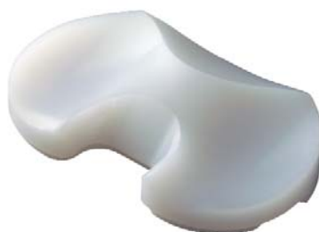
CR Deep Flex Insert

GENESIS II polyethylene is machine-compression-molded and sterilized using a non-degrading sterilization method to reduce the possibility of oxidation in vivo