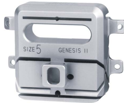
AP Cutting Block

Low-profile, tissue-friendly cutting blocks work with both standard and MIS exposures