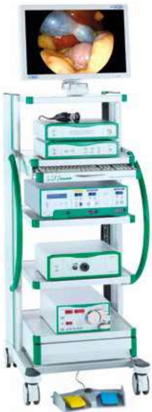
classic-cart Application for endoscopy