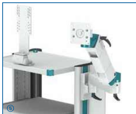
Variable height support arms (with or without a swivel arm) can be attached by means of a bottom shelf, or else fastened directly to the power column.