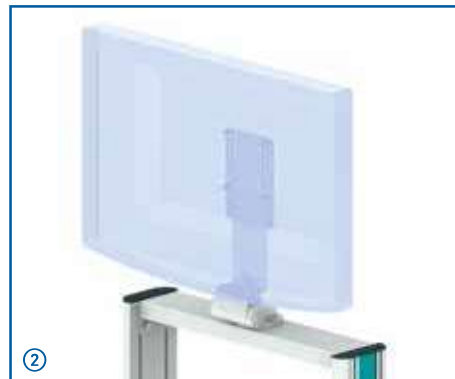
classic-cart can accommodate several types of monitors on its monitor shelf or on a monitor crossbeam.