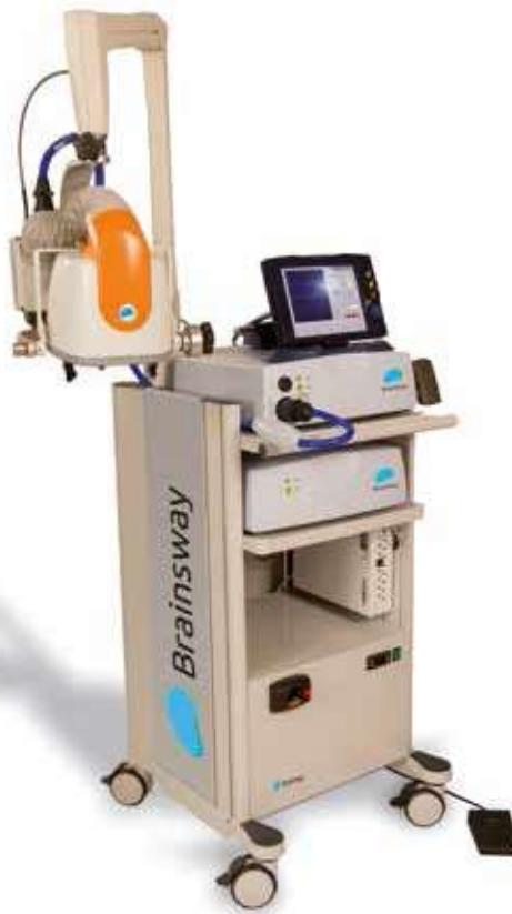
classic-cart Application for magnetic brain stimulation