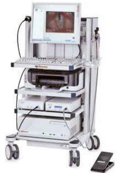
classic-cart Application for vocal fold function analysis