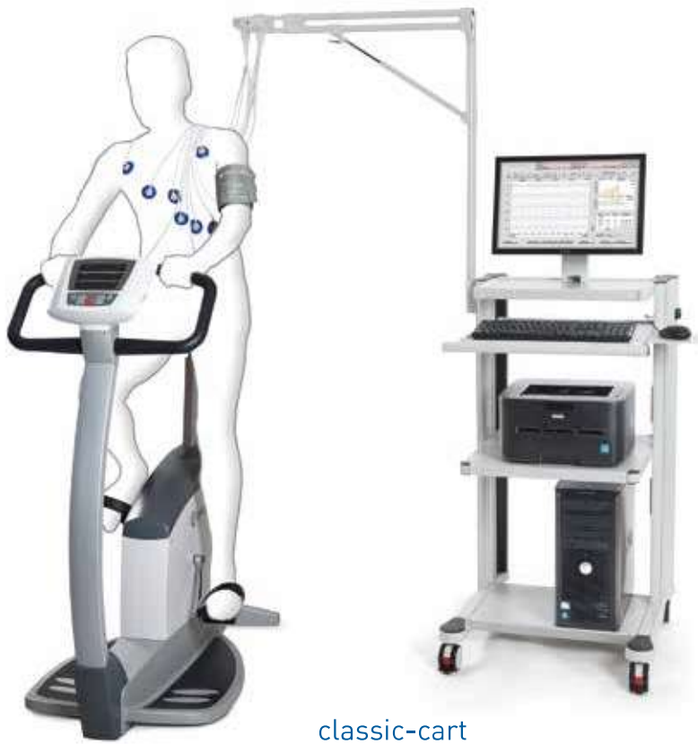
classic-cart Application for stress test ECG