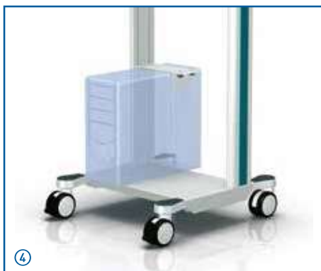
Many accessories, such as for example brackets for holding computers, satisfy the most varied needs.