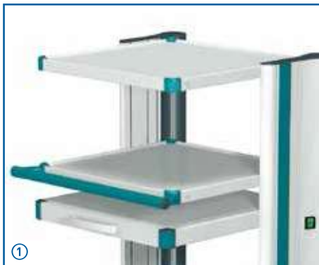
Shelves are supplied in different versions and the continuous raised edge offers your valuable equipment a secure hold.