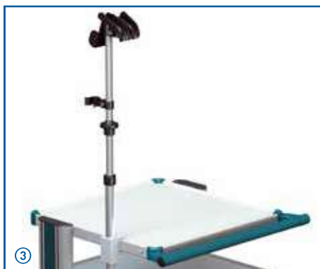
The endoscope holder can be mounted variably on the shelves using two rail fasteners or within the vertical extrusion.