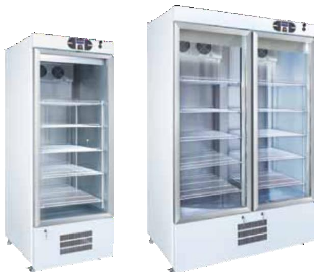
EKT 725 580 L