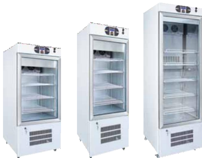
EKT 175 200 L