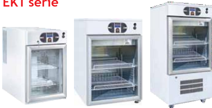
EKT80 65 L