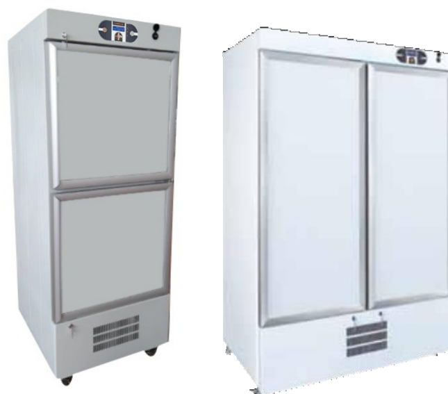
EKT2x725 600 L