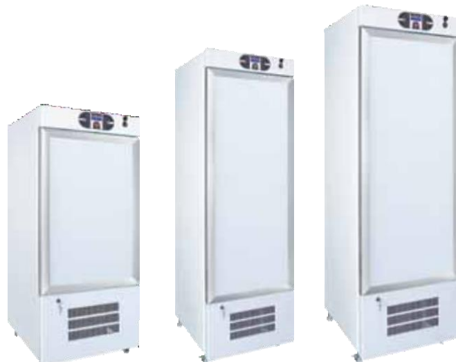
EKT-B 175 200 L