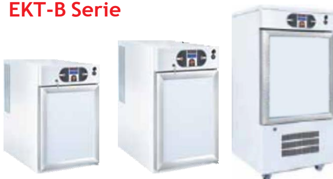
EKT-B 80 65 L