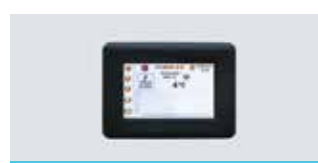
OPTIONAL TOUCH SCREEN DISPLAY