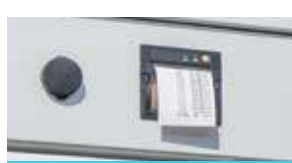
OPTIONAL THERMAL PRINTER