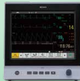
X12 Patient Monitor