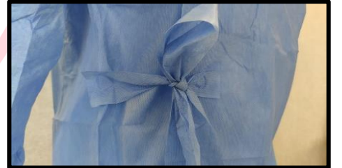
Neckline made of PP material