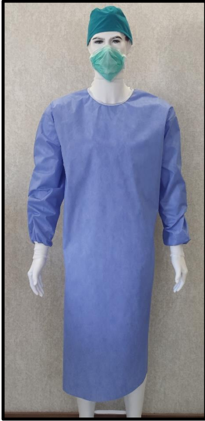
Neck fastening with velcro