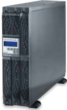
3 101 77