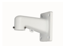
PFB305W Wall Mount Bracket