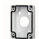
PFA120 Junction Box