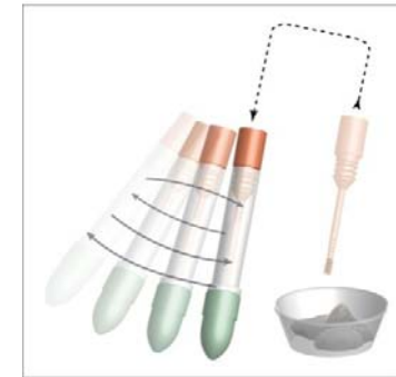
Specimen collection Steps 5 and 6