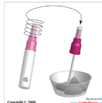
Specimen collection Steps 3 and 4