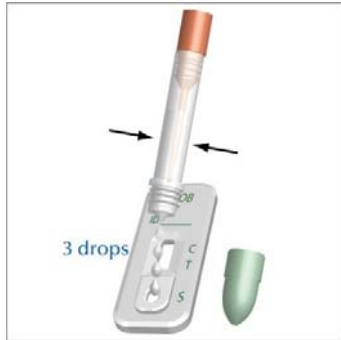
Assay Procedure Step 4