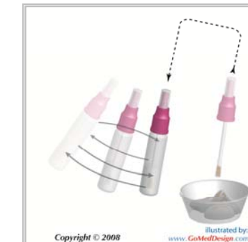
Specimen collection Steps 5 and 6