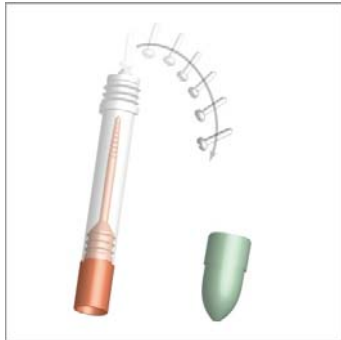
Assay Procedure Step 3.1

Note: Results read after 10 minutes may not be accurate.