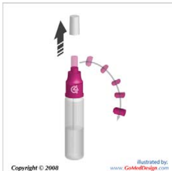
Assay Procedure Step 3.2