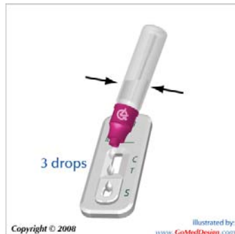
Assay Procedure Step 4