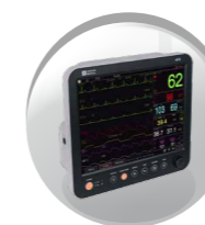
Bed to bed view via central monitor station