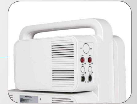
Parameter case for optional parameters