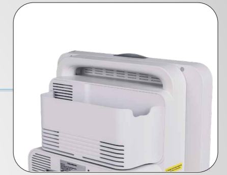
Accessory box for standard configuration